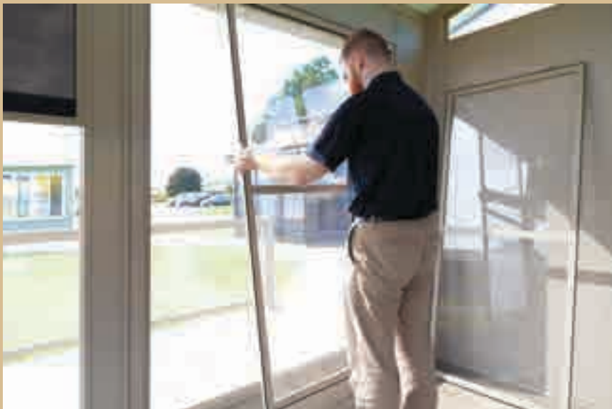
Spring loaded vents lift out easily for simple cleaning & storage